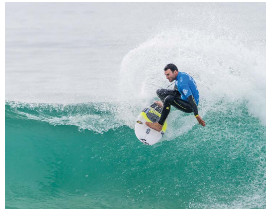
Surfing with a world champ