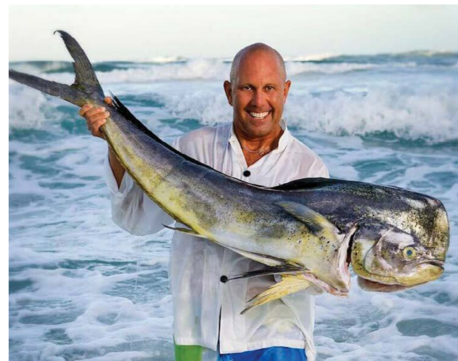
Create in the most awarded regional restaurant in Australia