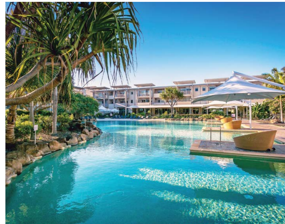
Peppers Salt, Kingscliff