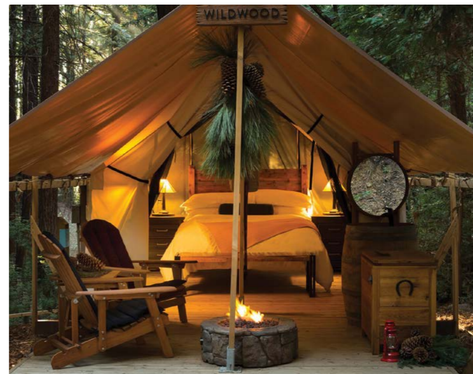
Outdoor Hotel, Cabarita