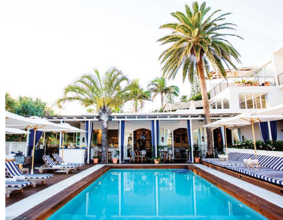
Halcyon House, Cabarita

For something different, an 'outdoor hotel'