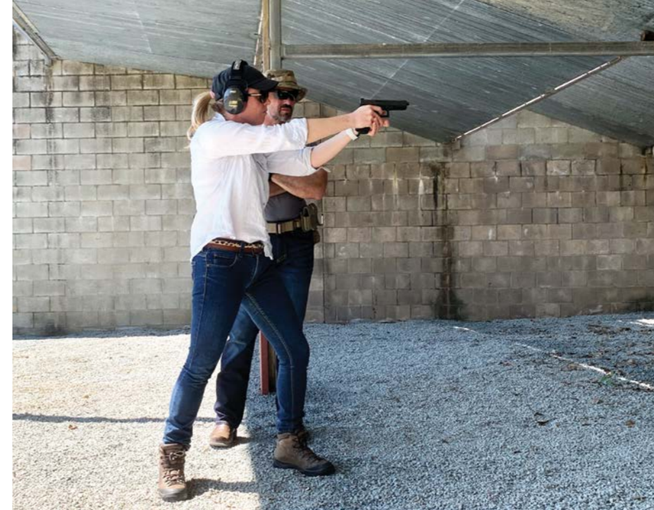
'Special Ops', range shoot

Join the ever-charismatic Head Chef at the most awarded regional restaurant in Australia.